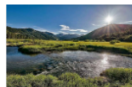
Truckee Donner Land Trust, Squaw Valley Public Service District to buy piece of Olympic Valley