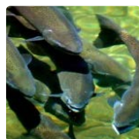
SYRCL Threatens Lawsuit to Protect Yuba River Fish