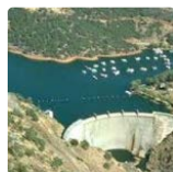
SYRCL Files Another Law Suit to Protect Yuba