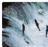
Federal Fish Agency Reverses Direction on Army Corps’ Responsibility for Dams’ Impacts on Salmon